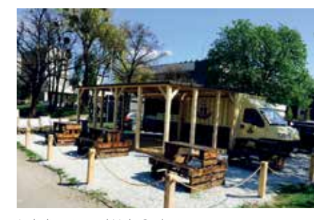
Lokalizacja pod Halą Stulecia

Their truck stands next to the Centennial Hall so it's another place where you can order lunch and eat it sitting on one of the comfortable benches, admiring the beauty of the surroundings.